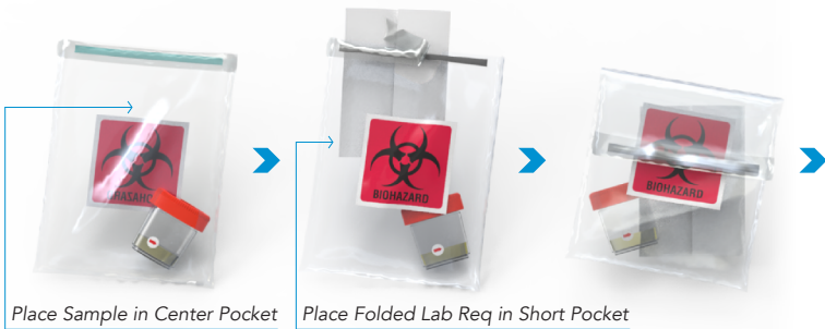
Place Sample in Center Pocket Place Folded Lab Req in Short Pocket