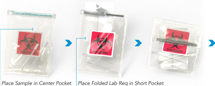
Place Sample in Center Pocket Place Folded Lab Req in Short Pocket