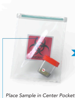
Place Sample in Center Pocket