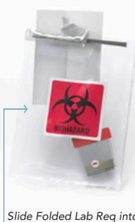
Slide Folded Lab Req into Open Pocket