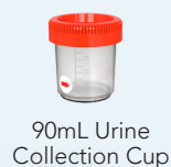
90mL Urine Collection Cup