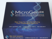
Shipping Box (Return Label Attached)