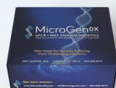
Shipping Box (with Return Label)