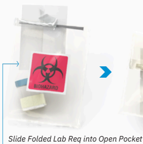
Slide Folded Lab Req into Open Pocket