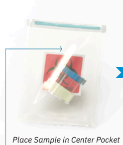
Place Sample in Center Pocket