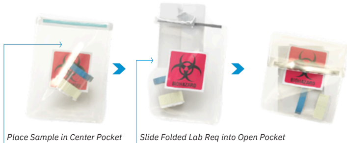
Place Sample in Center Pocket