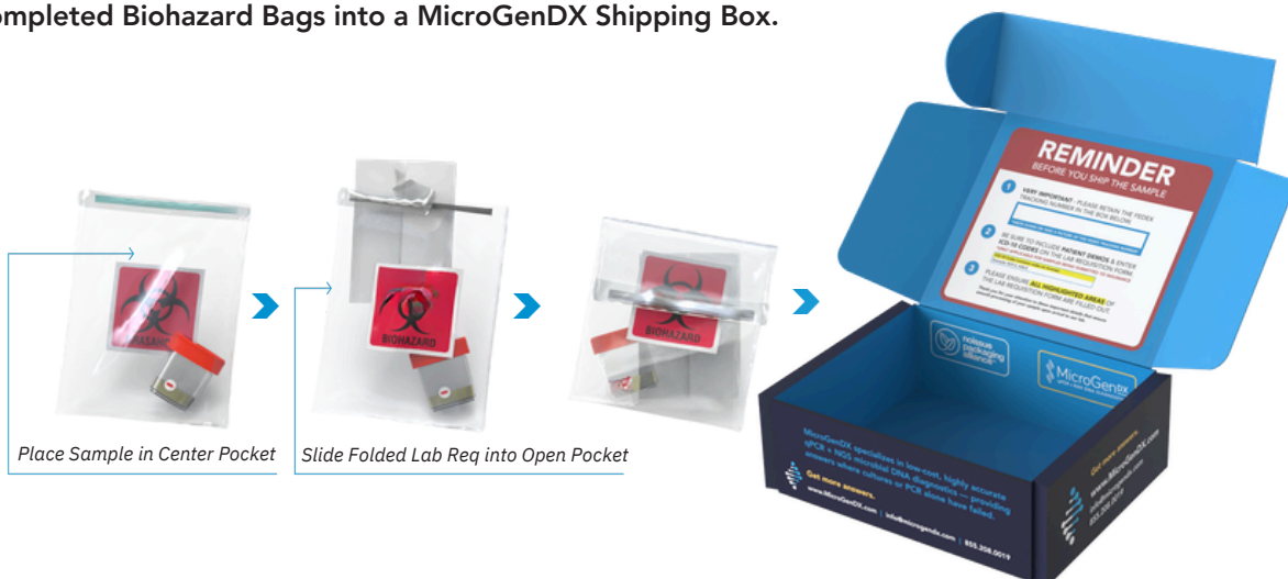
Place Sample in Center Pocket

Slide folded Lab Requisition Form into the open back pocket of ONE of the two provided Biohazard Bags.