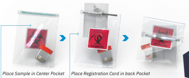
Place Sample in Center Pocket

Place folded Lab Requisition Form into the short pocket of ONE of the two provided Biohazard Bags.