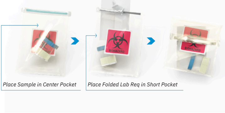
Place Sample in Center Pocket