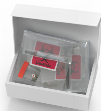
Place Folded Lab Req in Short Pocket

NOTE: If you are shipping multiple complete test samples in one box, please make sure to place a complete set of samples (urine & vaginal or urine & semen) for each individual patient into a single Ziploc bag (included). A complete set should consist of 2 bio bags each containing a single collected sample. As a reminder, please make sure to fill out the patient's name and date of birth sticker that is located on the outside of the larger Ziploc bag.