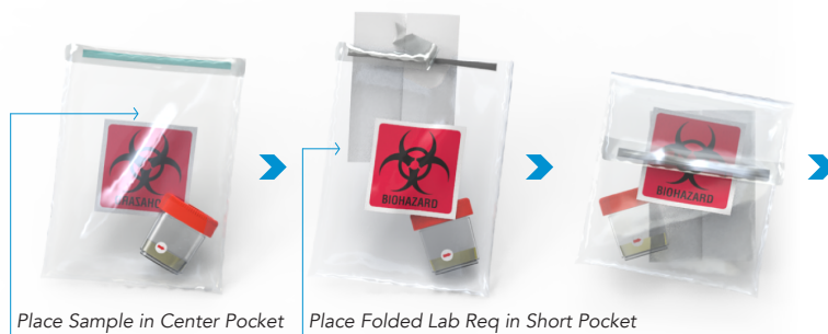
Place Sample in Center Pocket