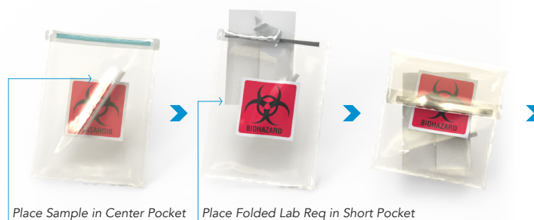
Place Sample in Center Pocket