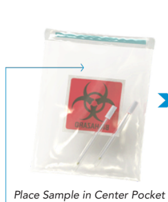
Place Sample in Center Pocket