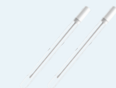
2 Vaginal Swabs