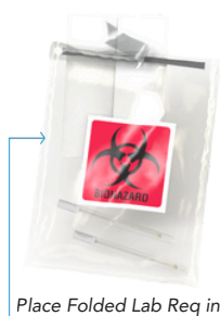
Place Folded Lab Req in Short Pocket