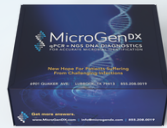
Shipping Box (with Return Label)