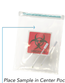
Place Sample in Center Pocket