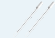
2 Vaginal Swabs